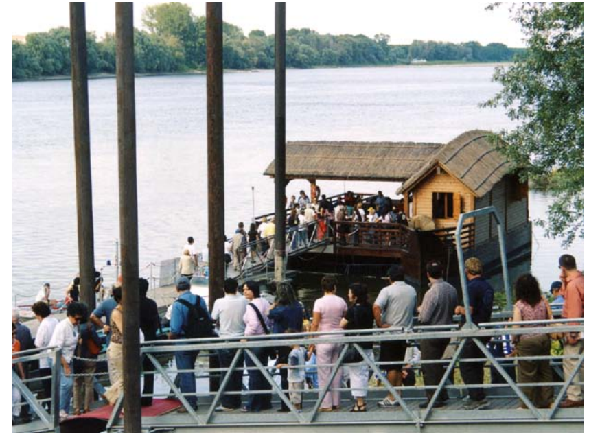
Ro, Mulino sul Po

From Ro this route unfolds across little hamlets with churches, minor roads and watercourses marking out irregular portions of countryside; all a prelude to the landscape of the great Ferrara land reclamation. The route then leaves the Destra Po cycleway on the river embankment to run as far as Copparo and the banks of the Po di Volano, through to the nature reserves of the Anse Vallive di Ostellato .