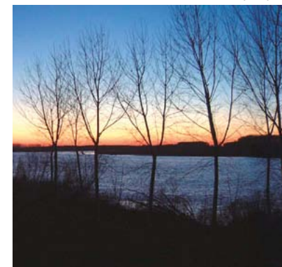
The River Po

to the Este family. At one point it was surrounded by lagoons and then involved with the land reclamation which dried out the Valle del Mezzano. Today from that area all that remains are the Anse Vallive , our destination, which constitute a biotype freshwater wetland area unique in the region, especially for the quantity and variety of its animal life.