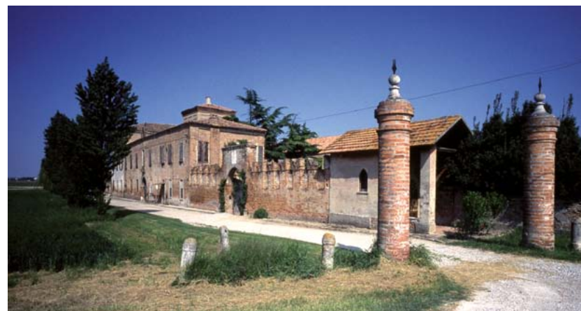
Sabbioncello San Vittore, Villa della Mensa

From Copparo we reach Sabbioncello San Vittore almost entirely on a restricted traffic route (the FE211), and there we start alongside the Po di Volano which at this point is part of the Ferrara waterway, passing by the Villa della Mensa .