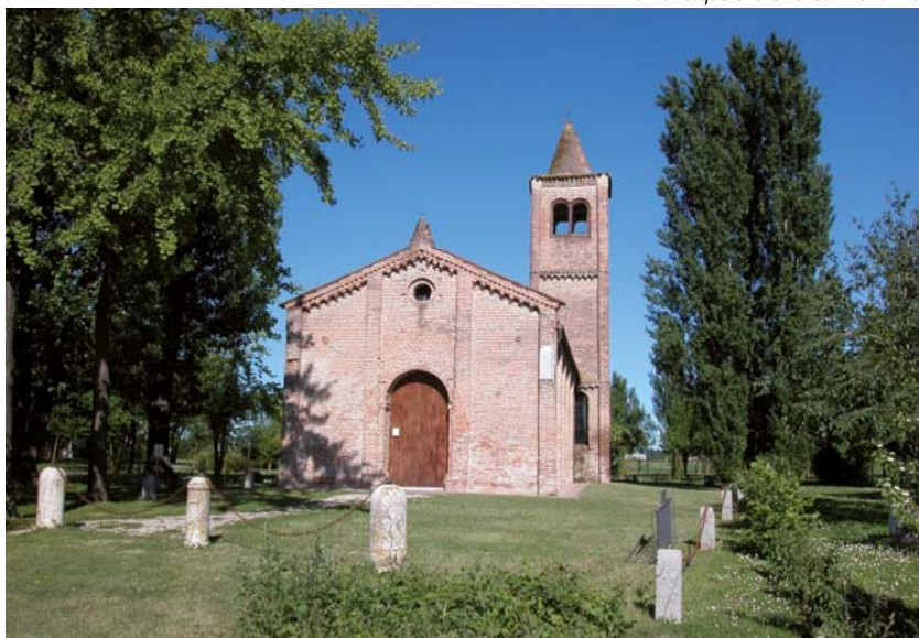
Romanesque Church of San Venanzio

The point of departure here is the areas beside the river where the ' Mulino sul Po ' is anchored. This is a faithful reconstruction of the mill boats which were on the river hereabouts over a century ago, and has been placed in a very attractive natural surroundings: the Mill isn't just an open-air museum, but a living and productive reality where you can watch the milling and the preparation of bread in a tourist centre with moorings and a landscaped area by the river. We proceed on minor roads towards Ro , through Zocca where we turn onto the main part of the limited traffic path (the FE206) that leads to Copparo . Before the centre, the enchanting Romanesque Church of San Venanzio welcomes the visitor; it is one of the oldest buildings in the province and has frescoes of the Bolognese school from the mid 14 th Century. The town of Copparo, founded in the mediaeval era, grew up on Este hunting grounds which we can see by the building of the Town Hall (Palazzo Comunale) on the ruins of an Este country house.