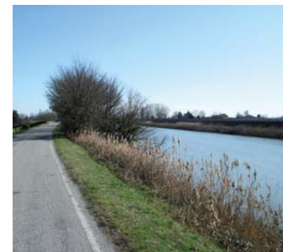
The Po di Volano between Final di Rero and Migliarino

vere, as a summer residence for the Bishops of Ferrara. After Villa della Mensa the track becomes cycleway only and stays with the Volano as far as Final di Rero. Just before this, note the lock basin at Valpagliaro which works with wind powered doors and allows a drop of about 3 metres. After Final di Rero , this pleasant cycle track, here named Via delle Siepi, goes alongside an area of the Volano embankment that is being ecologically rebalanced with native vegetation, and is particularly pleasant in spring.