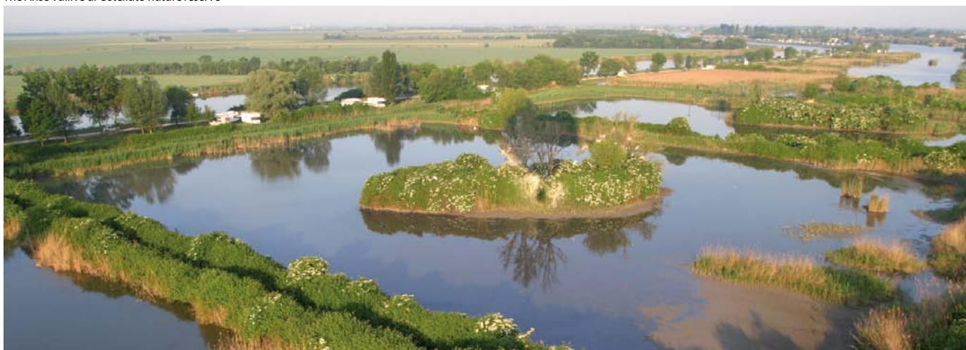
The Anse Vallive di Ostellato nature reserve

The first village is Contrapo , dominated by the elegant facade of its 17 th century parish church, San Martino, where we find the Bishop's House 'Casa del Vescovo', later called 'Casa Mistri', which dates we think from the 16th century. At Viconovo , under the Volano embankment, is the villa once known as 'dei Costabili' that in 1845 was the property of William Mac Alister, a rich Scottish merchant who resided a long time in Ferrara and used his post of British Consul to defend the city from abuses of power under the Austrians. At Albarea , next to the church, was the great house belonging to Gian Battista Aleotti, known as 'l'Argenta', the Dukes' architect and engineer. Villa Gandini, later known as Colombari, with decorations in the Art Nouveau style, is in Villanova di Denore .