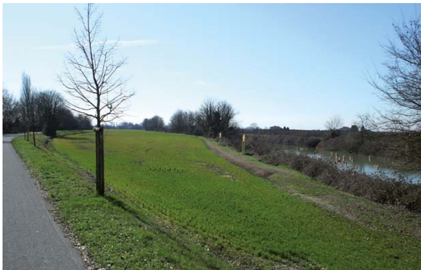
Final di Rero, Via delle Siepi