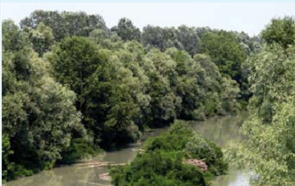
Bosco della Panfilia, Fiume Reno